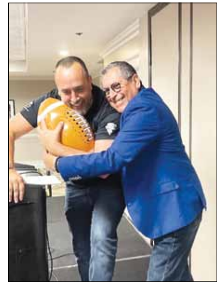
Chamber ambassadors bring energy and camaraderie to the event as they jokingly battle for the first throw.

Business Card Exchange series in such welcoming style. It was a wonderful start to 2026, bringing local professionals together to forge partnerships and build community.