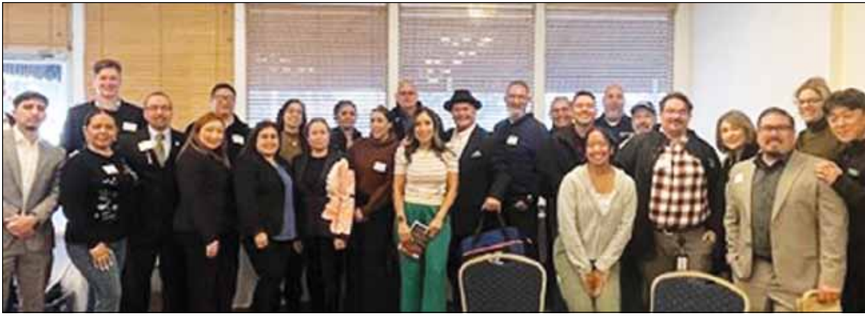
A strong turnout of Chamber members and guests filled Gathering n' Stuff for the latest Networking @ Noon event.