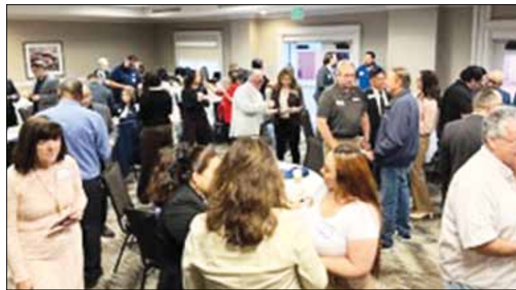
Everyone is getting into the networking game!