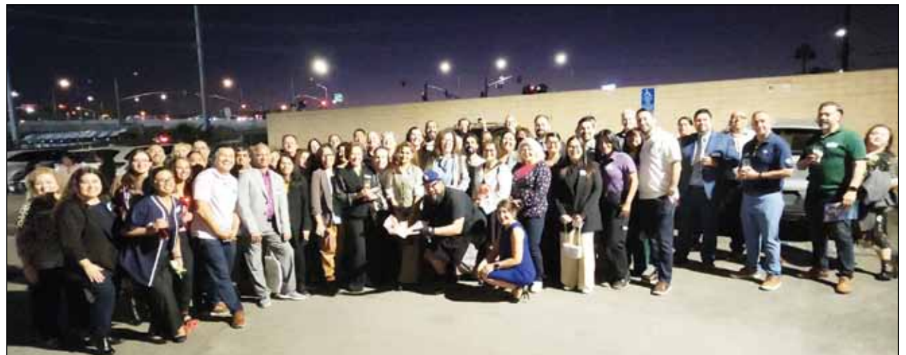
Under the lights at La Jara Brewing Company!